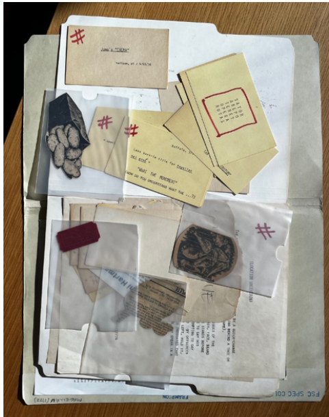
Hollis Frampton Sketches and Diagrams at MOMA Collection

She was impressed with the range of cinemas and moving image institutions across the City, which in six months she got to know. Another highlight of her experience was the opportunity to attend lectures and performances with other ACC Fellows, taking their lead. "I would not have visited on my own. I would not have realized the exciting performing arts scene," she says.