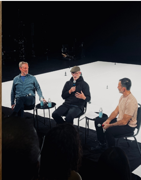
Wally Cardona's Performance at New York Live Arts