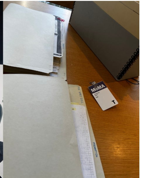
Research at MOMA Film Archive